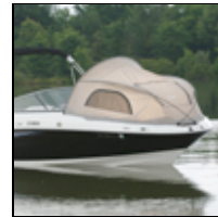
Yamaha Boat Bow Tent