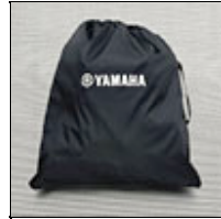
Sport Boat Cover Storage Bag