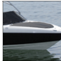
Yamaha Boat Bow Covers