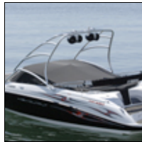
Yamaha 230 Series Cockpit Covers