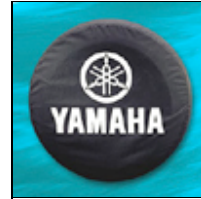
Yamaha Spare Tire Cover