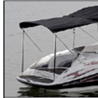
Yamaha Boat Bimini Extension