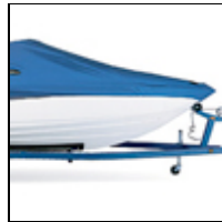
230 Series Mooring/Trailing Covers (Non Tower)